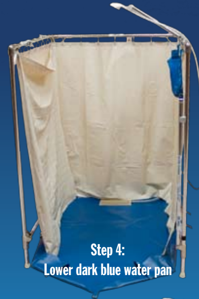
Step 4: Lower dark blue water pan