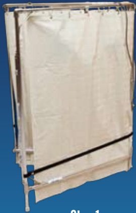
Step 1: Stand Unit Upright