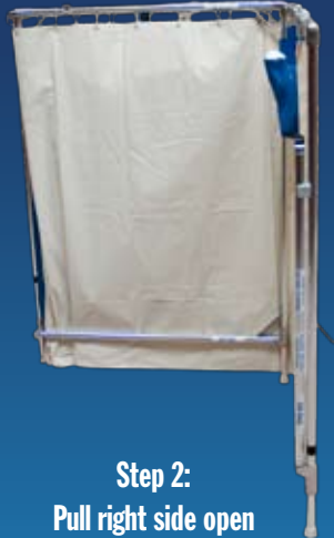
Step 2: Pull right side open