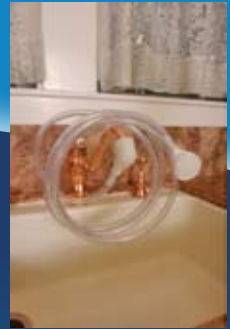
Step 9: Attach showerhead to faucet