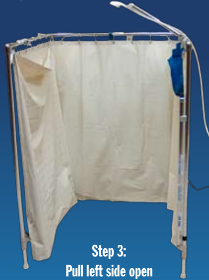
Step 3: Pull left side open