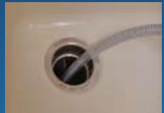
Step 10: Place water waste tube in drain