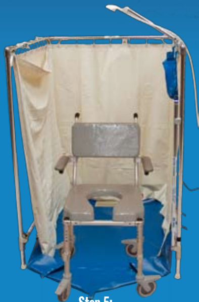
Step 5: Roll backward into shower