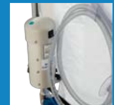
Step 12: Turn on the pump