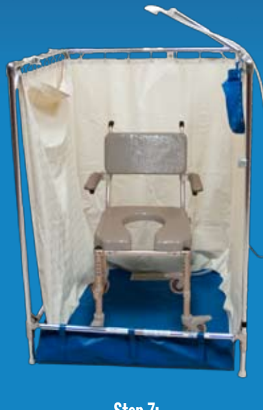
Step 7: Connect water pan to shower with attached velcro strips