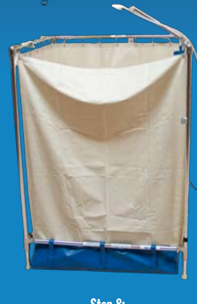
Step 8: Front shower curtain can be closed for privacy